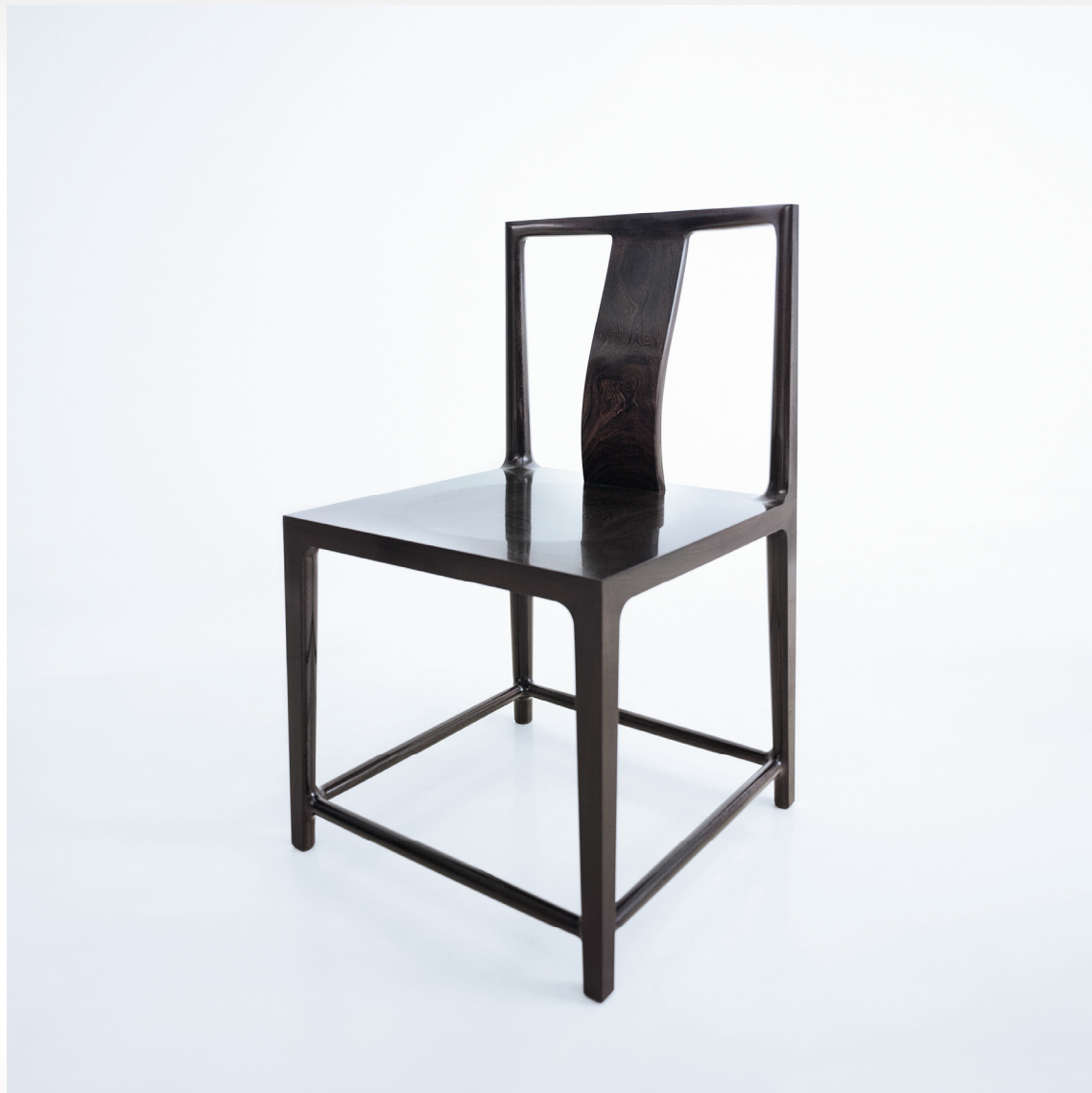
大天地 之 紫檀 Da Tian Di (Zitan)