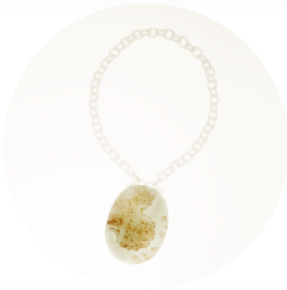
鸿禧 Jade Treasure